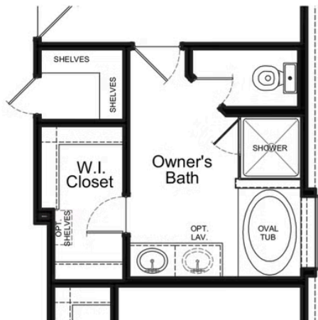
Enhanced Owner's Bath Option