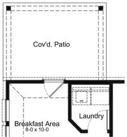
Expanded Covered Patio Option