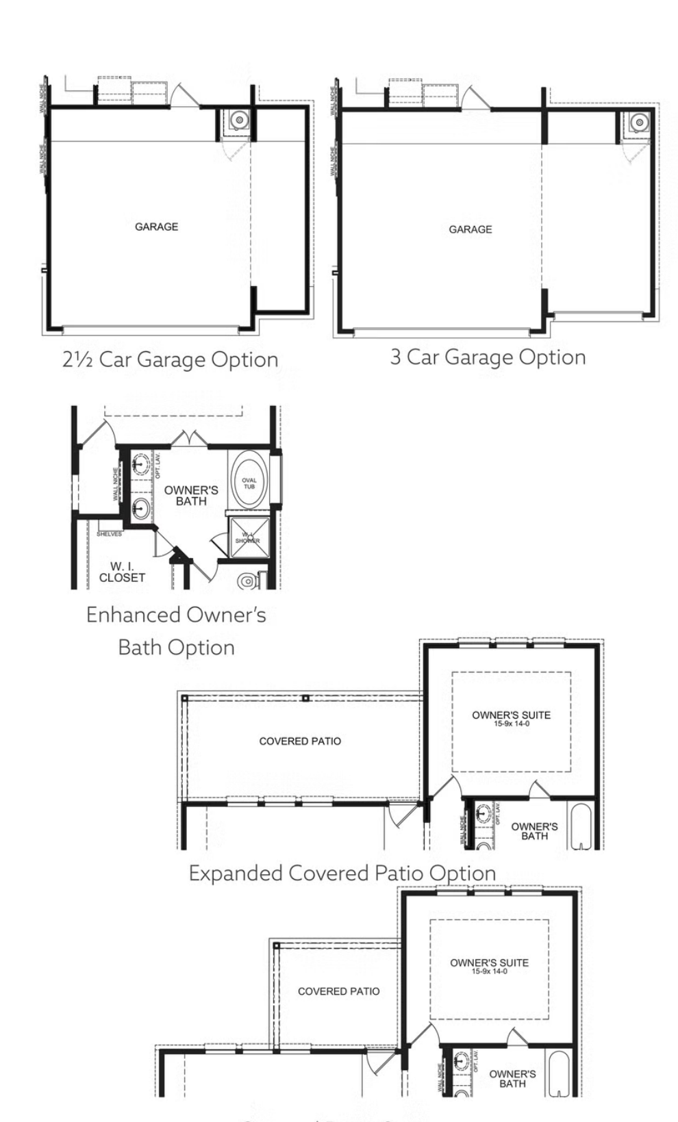
Covered Patio Option