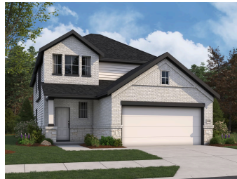
11208 Schmidt Ln Converse, TX 78109