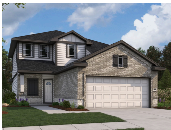
11135 Schmidt Ln Converse, TX 78109