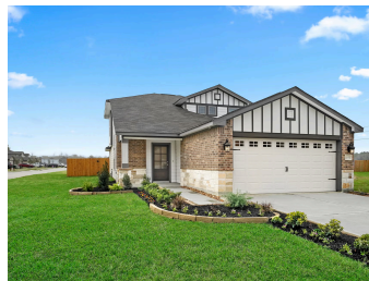
2917 Leclerc Rd Converse, TX 78109