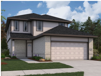
11215 Schmidt Ln Converse, TX 78109