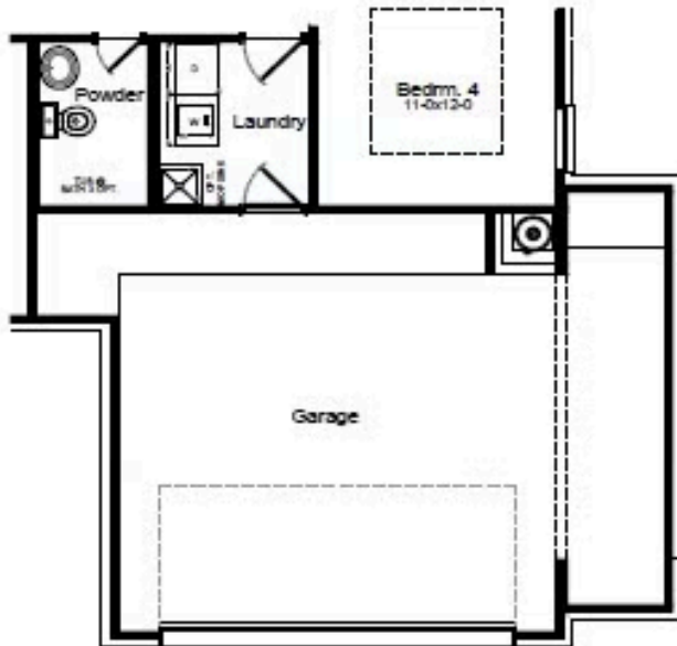
2 1/2 Car Garage