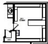
Extended Closet Option