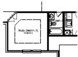
Bath 3 Option