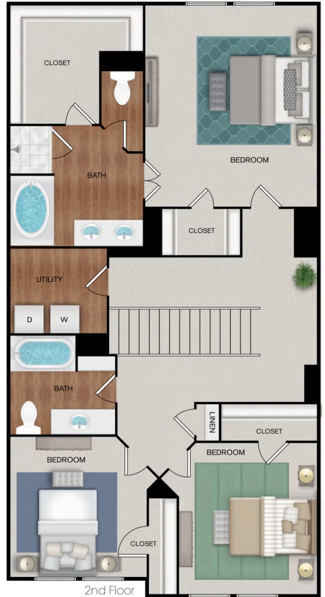
Three Bedroom | Two and Half Bath 1746 Sq Ft

*Floor plan as shown may include upgraded options.