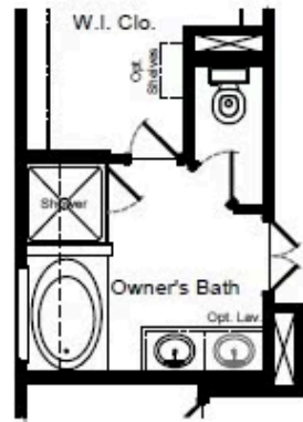
Luxury Bath Option