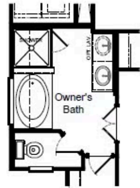
Luxury Bath Option