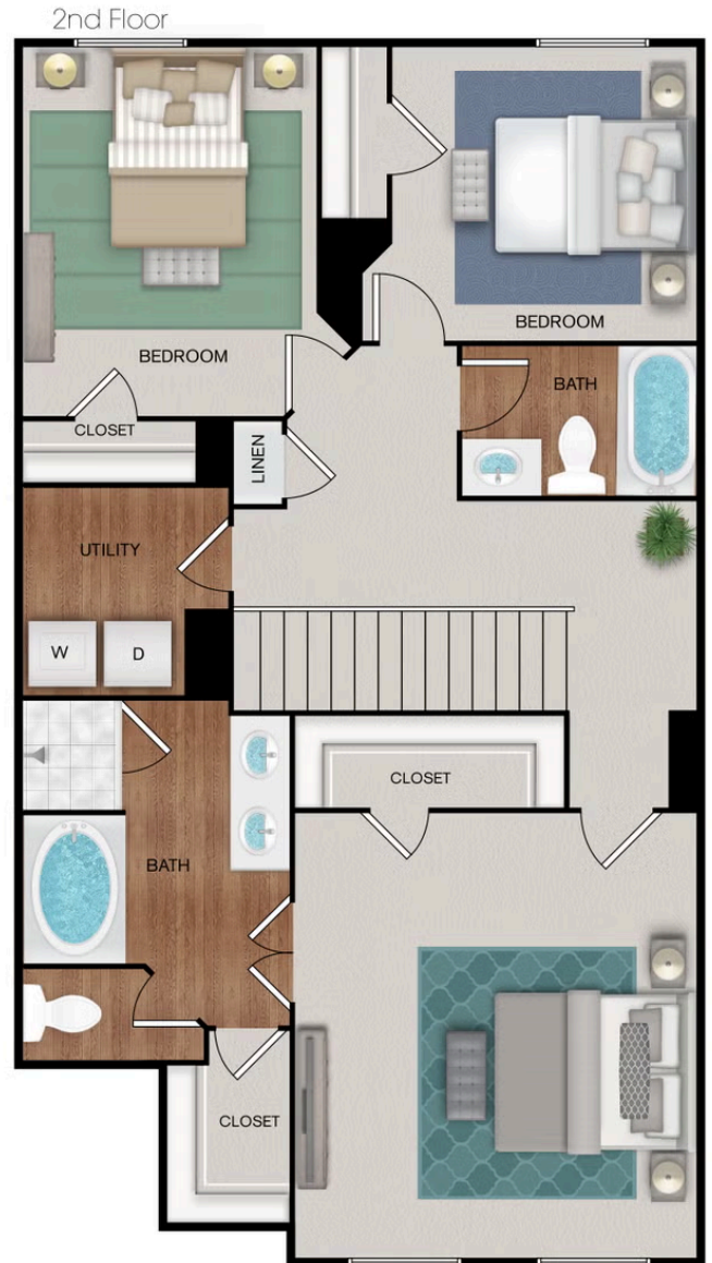
Three Bedroom | Two and Half Bath 1620 Sq Ft

*Floor plan as shown may include upgraded options.