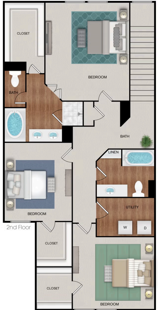
Three Bedroom | Two and Half Bath 1727 Sq Ft

*Floor plan as shown may include upgraded options.