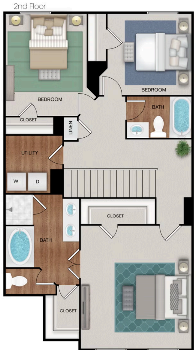
Three Bedroom | Two and Half Bath 1620 Sq Ft

*Floor plan as shown may include upgraded options.