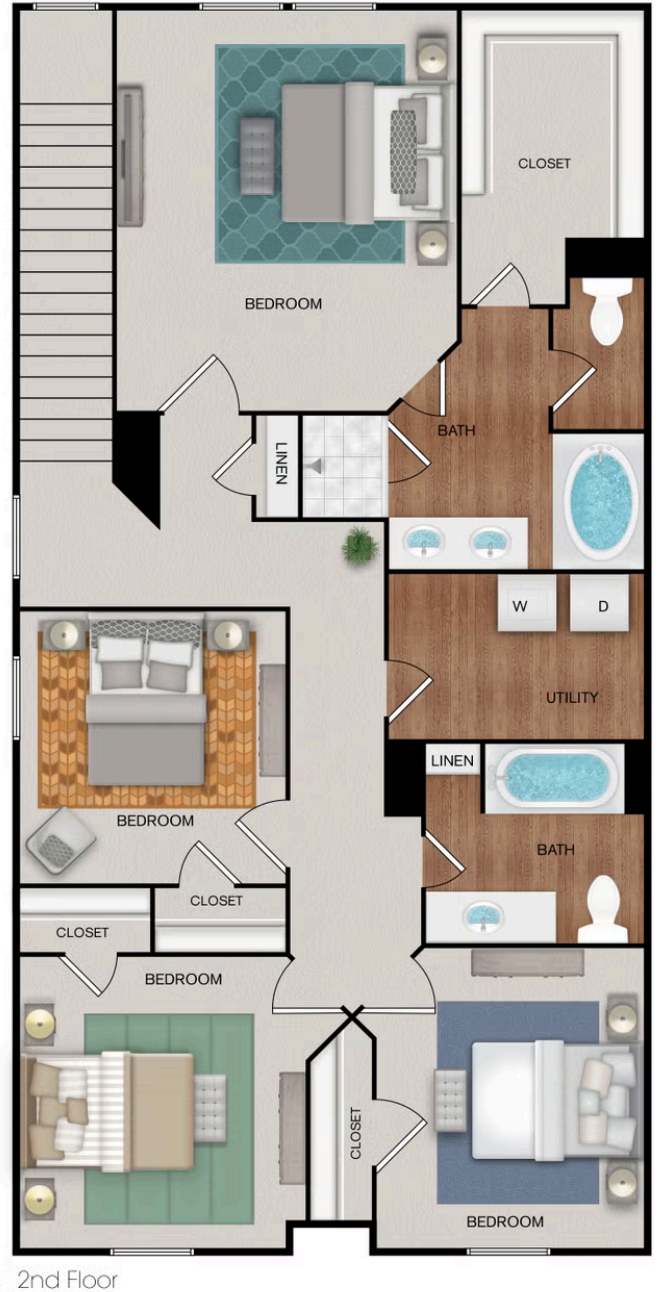
Four Bedroom | Two and Half Bath 1802 Sq Ft

*Floor plan as shown may include upgraded options.