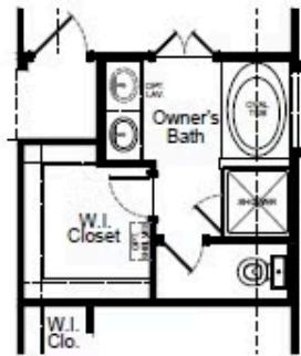
Luxury Bath Option