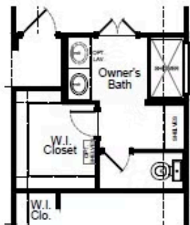
Super Shower Bath Option