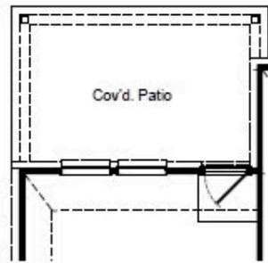
Expanded Covered Patio