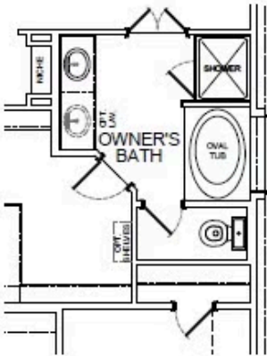
Luxury Bath Option