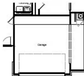
1/2 Car Garage