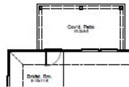
Expanded Covered Patio