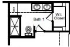
Super Shower Option