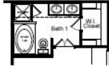
Luxury Bath Option