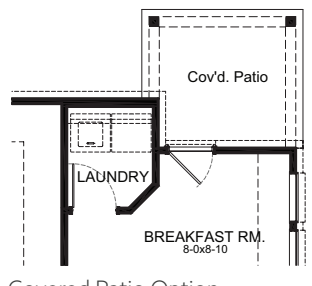
Covered Patio Option